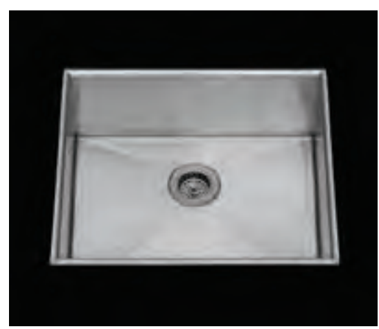
*Flush-Mount Installation Kit is included with each sink *Custom ADA compliant versions are available